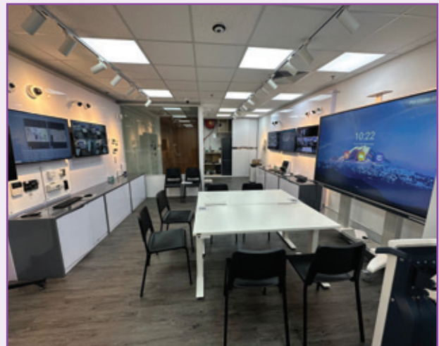
New Solution Showcase Room 新系統解決方案展示廳