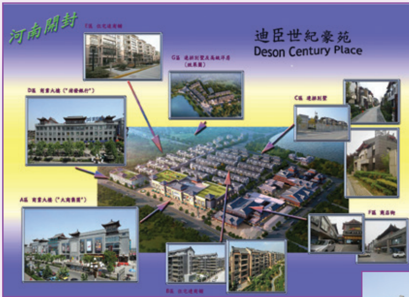
Kaifeng Deson Century Place 開封迪臣世紀豪苑