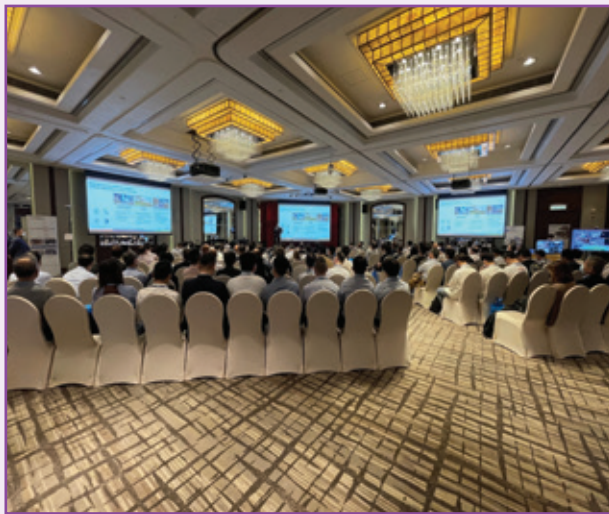
Hotel Conference 酒店研討會

同時，我們積極加強市場推廣，透過舉辦多個大小型研討會以及參加不同的本地展覽會，致力於加強客戶對我們產品的認識，並擴闊銷售渠道。此外，我們新設系統解決方案展示廳，將科技應用帶到真實環境中展示，進一步增加我們與客戶之間的互動。這個展示廳不僅提供給客戶最新的科技解決方案，更讓他們能夠實際體驗我們的產品，了解我們的技術及服務。