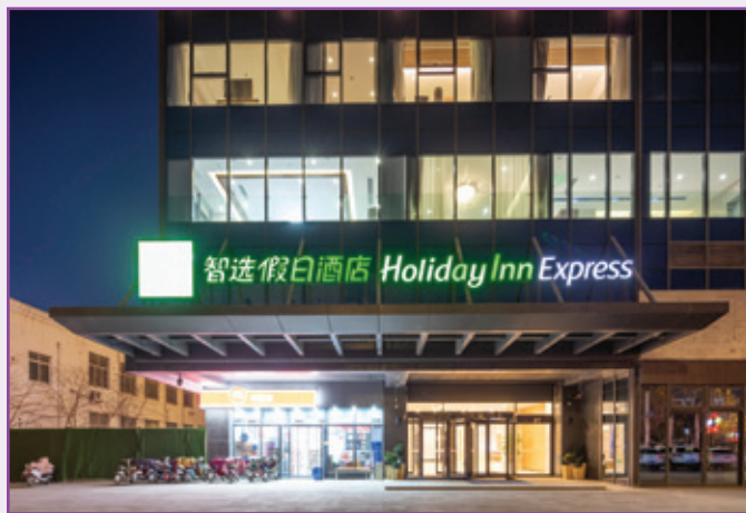
Holiday Inn Express Kaifeng City Center 開封迪臣智選假日酒店